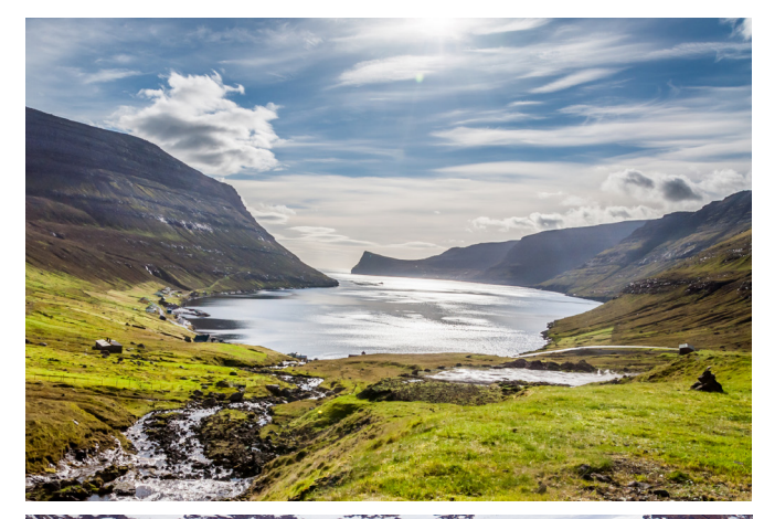
The Faroe Islands

This geography stands in stark contrast to the Faroe Islands and Greenland, which are part of the Danish 'Commonwealth', literally translated into the Danish Realm Community. The Faroe Islands, midway between Denmark and Iceland, are a set of rocky and rugged islands of 540 square miles with a population of 48,700, a large fishing industry and a smaller pastoral sheep-herding culture. Greenland is a vast, Arctic area, consisting of 839,109 square miles and 55,000 inhabitants. It is the world's largest non-continental island, its capital Nuuk nested on the southwestern shoreline, and most of it covered by the Greenland ice sheet. All population centres are on the coast, with the population concentrated on the western coast.