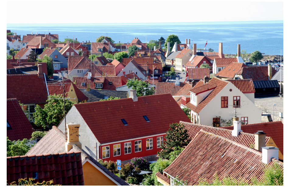
Island of Bornholm

The northernmost point, not including Greenland and the Faroe Islands, is Skagen, the tip of Jutland, while the easternmost part is the island of Bornholm, located squarely in the West Baltic.